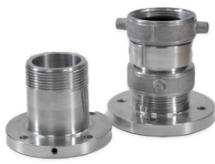
NH (National Hose)