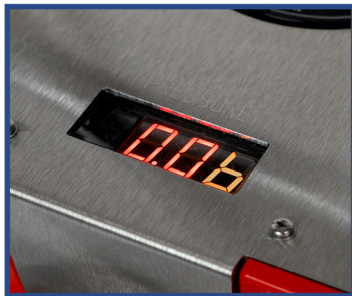
Easy to Read Pressure Readouts