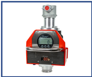
Lightweight & Portable