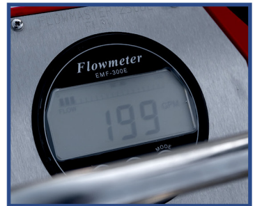
Simple Readout Display